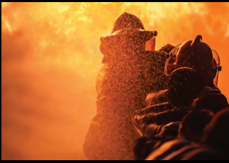
Emergency Response and Rescue

Any public safety, emergency response or special forces agency or operator needing reliable, agile, on-demand interoperable communications and situational awareness in the field needs the powerful capabilities of the Go Kit. The Go Kit delivers instant field operations fusion capabilities by delivering coordinated voice, video and information sharing within organizations and with partners. If you need to communicate or share real time video and information to execute your mission, the Go Kit is for you.