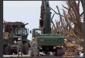
Civil Support and Reconstruction Teams