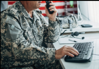
Civil Affairs Teams