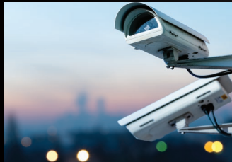
Field Surveillance Operations