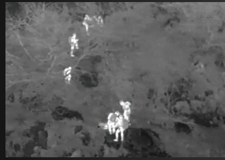
Rapid Response Teams