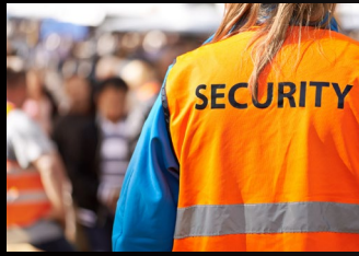
Large Scale Event Security